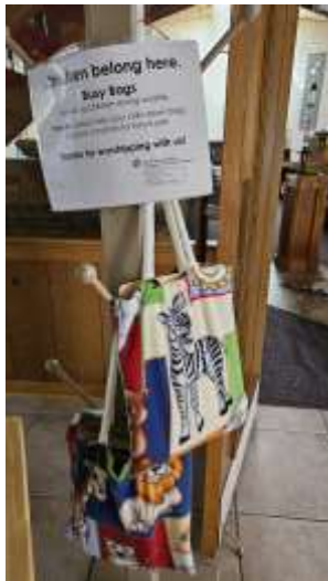
Childrens Activity bags